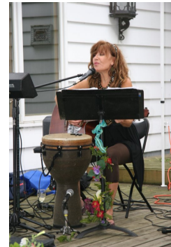
ArtStock Festival Musical Artists: The BZ Girls